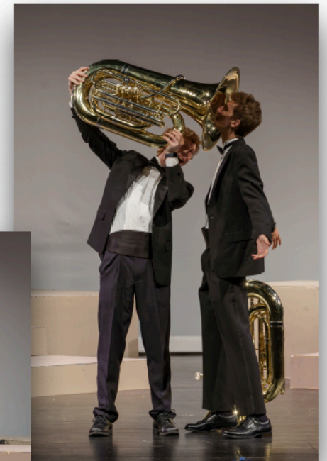
KHS Band program previous appearances at the Missouri Music Educators Association Conference: Wind Ensemble, 2010 Woodwind Chamber Ensemble, 2118